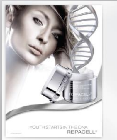
POSTER DIN A1