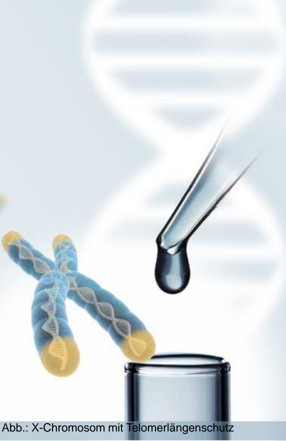
Abb.: X-Chromosom mit Telomerlängenschutz